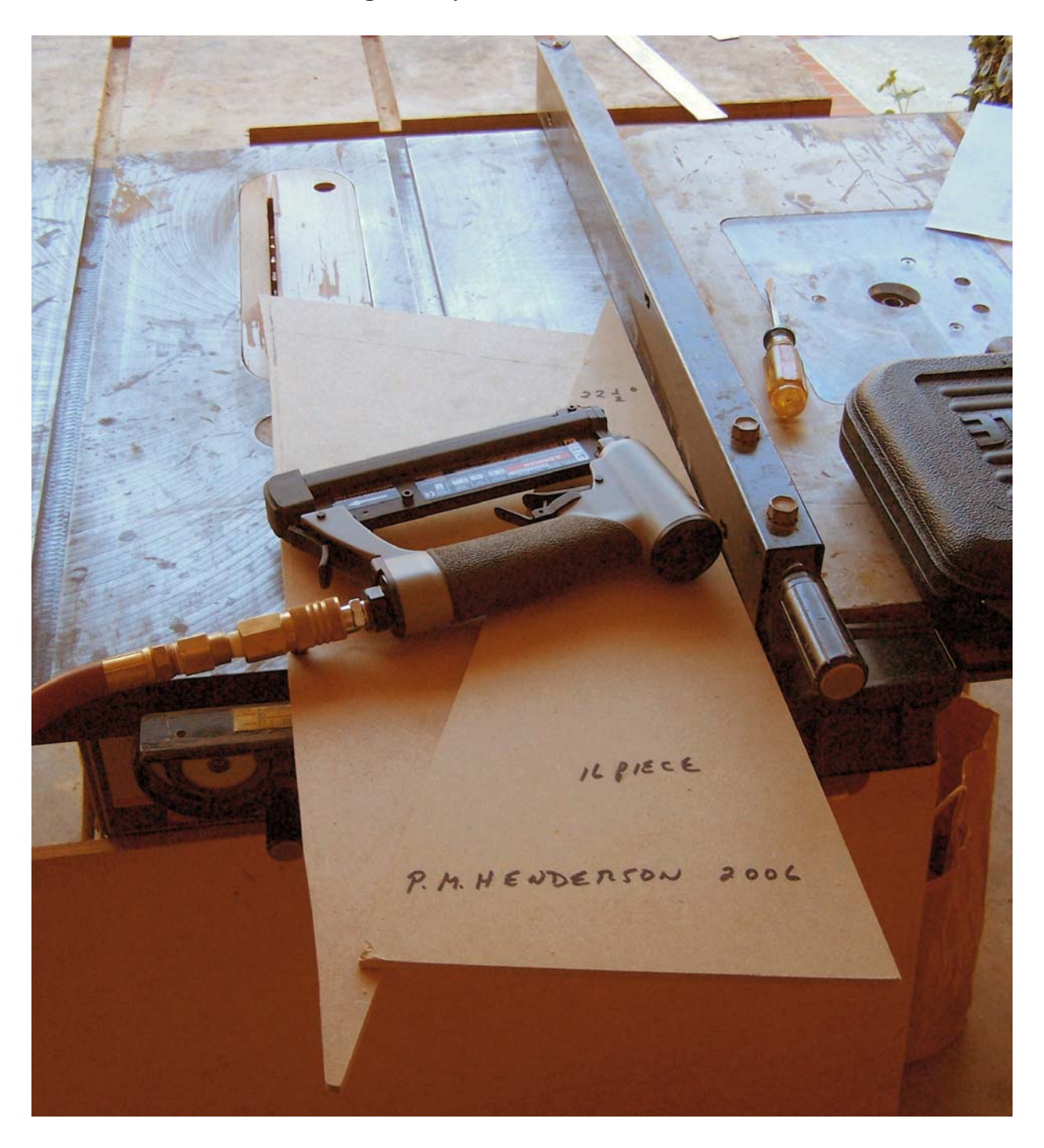
Making Templates for a Sunburst

Now we have the piece cut straight and true along side 3. But is the angle correct? That's what we'll have to verify, which is the next step.